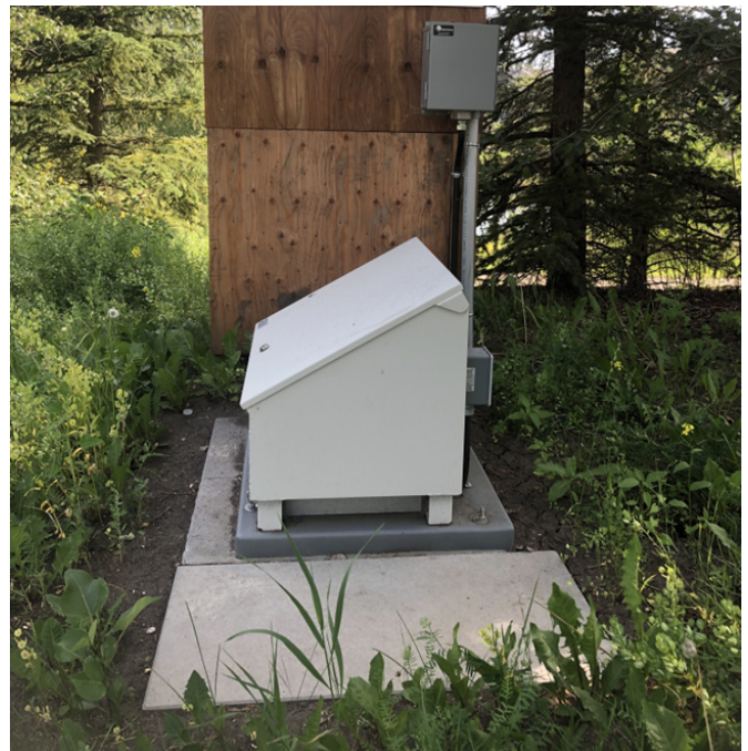
Example of a similar power source & compressor that will be installed nearby.

We thank you for your patience and understanding as we perform this necessary work.