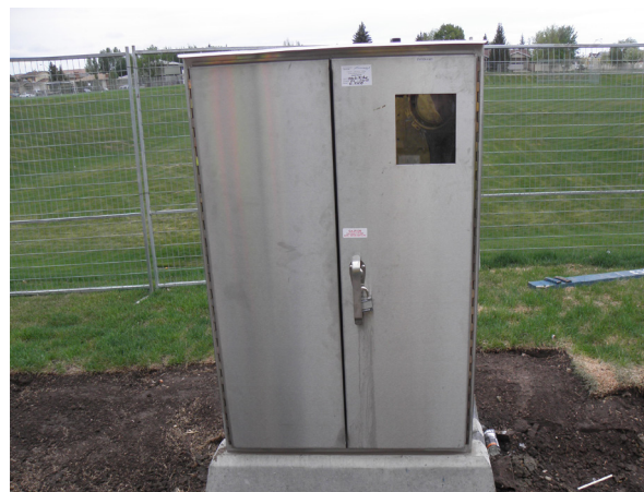
Example of a control box that will be mounted near the existing concrete structure

There may be temporary periodic impacts to the nearby trail and sidewalks as equipment will be used to transport materials to the site.