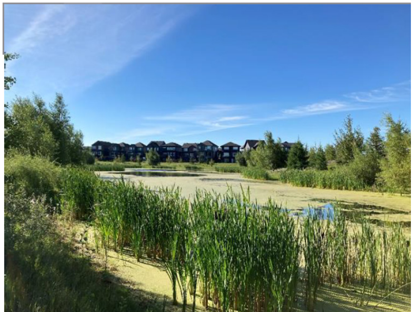
Graydon Hill storm water management facility